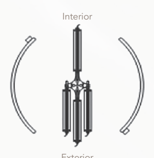
Referred fire alarm position ahown with 2 wings broken